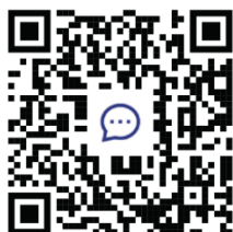
Feedback & Suggestions

Please like, share and follow our Social Media pages for regular updates on our Lighthouse Special Event Evenings: Quiz Nights / Comedy Evenings / Live Entertainment / Dinner & Dance and Culinary Experiences