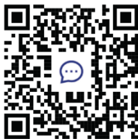
Feedback & Suggestions

Please like, share and follow our Social Media pages for regular updates on our Lighthouse Special Event Evenings: Quiz Nights/Comedy Evenings/Live Entertainment/ Dinner & Dance and Culinary Experiences