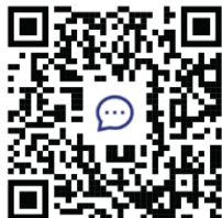
Feedback & Suggestions

Please like, share and follow our Social Media pages for regular updates on our Lighthouse Special Event Evenings: Quiz Nights / Live Entertainment / Dinner & Dance and Culinary Experiences